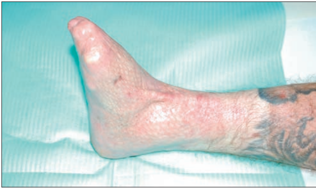
Figure 3. The foot after treatment.

of the foot is observed. The patient returned to work at a different job and is satisfied with the effect of the treatment (Fig. 3).