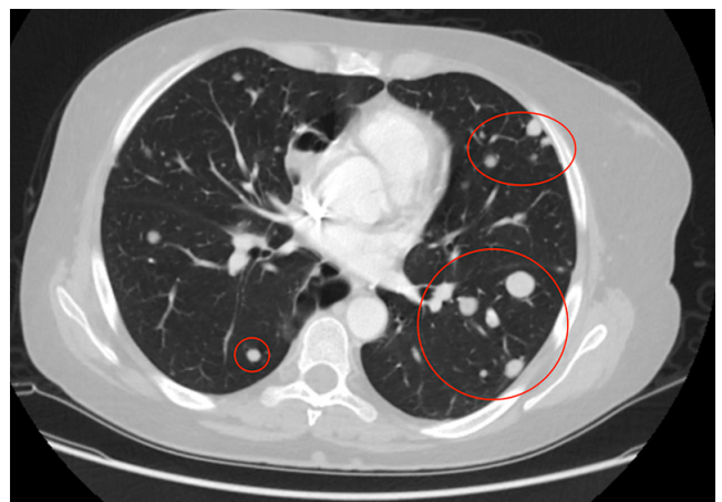
Figure 2B. Numerous metastatic foci in the lungs

Due to a discrepancy between clinical, radiological, and histopathological assessments, she was scheduled for definitive surgical management. The patient underwent a hysterectomy with bilateral salpingo-oophorectomy and resection of tumour lesions from the retroperitoneal space. Surgery was complicated by bilateral transection of the ureters and urinary bladder. These complications were adequately treated.