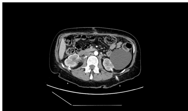
Figure 3. Post-operative CT scan

After 15 months of follow-up, the patient's condition was stable, with no radiological signs of disease progression. On a follow-up CT scan, the lung nodules have remained unchanged and no new suspicious nodules have appeared.