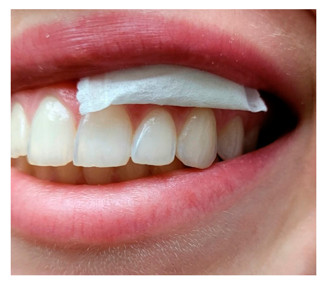
Figure 3. Method of consumption

Emergent non-tobacco oral nicotine products are largely composed of water and microcrystalline cellulose, which combined comprise approximately 80–90% of the ONP. The outer pouch material is composed of microcrystalline cellulose fibres that have been chemically, thermally, or solvent-bonded together. This matrix also contains sodium chloride, water, humidifying agents, a pH buffer – sodium carbonate, a filling agent, taste enhancers and flavourings,