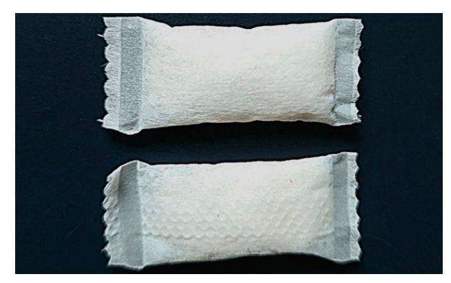
Figure 1. Typical nicotine pouch