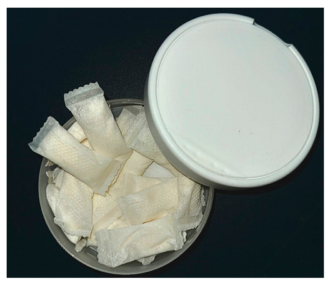
Figure 2. Product in container.