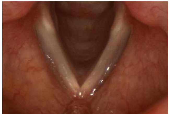
Figure 5. Healthy vocal folds – calm breathing [21]

A decisive advantage of computed tomography is the ability to visualize the entire length of the retrograde laryngeal nerves, as well as detect signs of possible paralysis of the