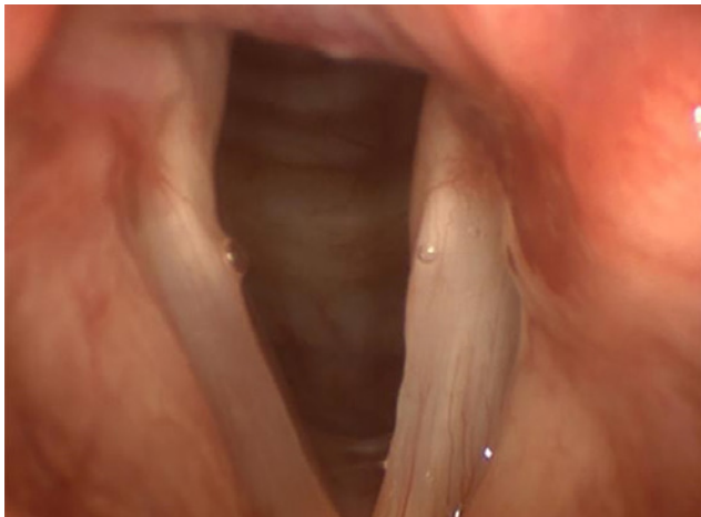
Figure 2. Paralysis of the right recurrent laryngeal nerve [19]