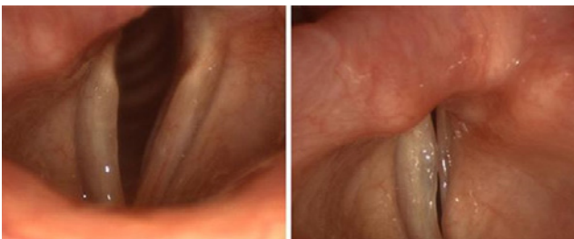
Figure 3. Paralysis of the left recurrent laryngeal nerve (calm breathing and shortened vocal folds)[19]