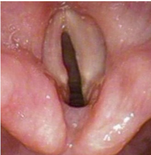
Figure 4. Bilateral paralysis of the vocal folds [20]

narrowing of the airways of this patient by about 75%. The patient suffers from severe dyspnoea at rest.