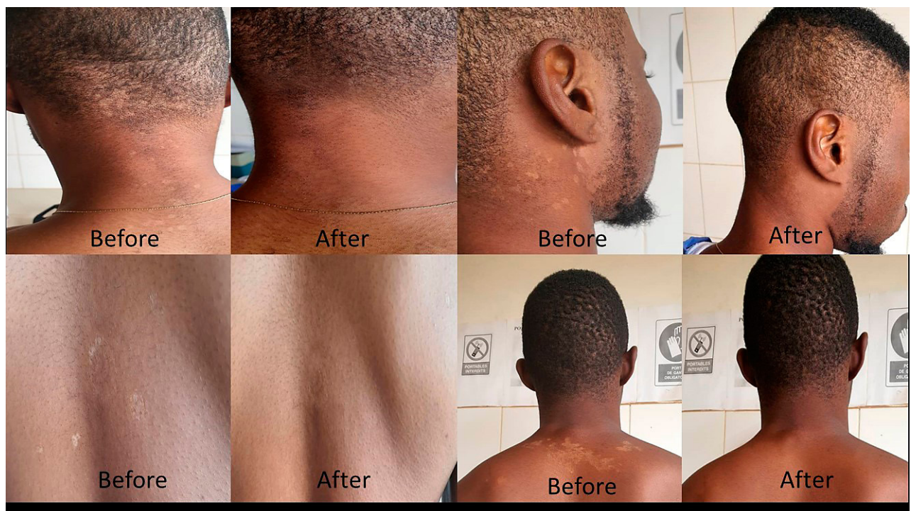
Figure 3. Sample photos of before and after treatment of Pityriasis versicolor with Mycofungi therapy

This randomized Terbinafine-controlled clinical trial demonstrated the efficacy of Mycofungi cream ( S. aromaticum ) to treat or reduce severity of skin mycosis.